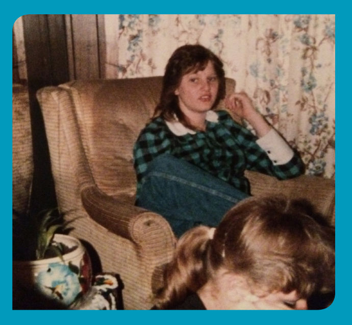
A treasured family photograph of Brittany's mother

The FMLA gives eligible employees—those who have worked for 12 months<sup>12</sup> and at